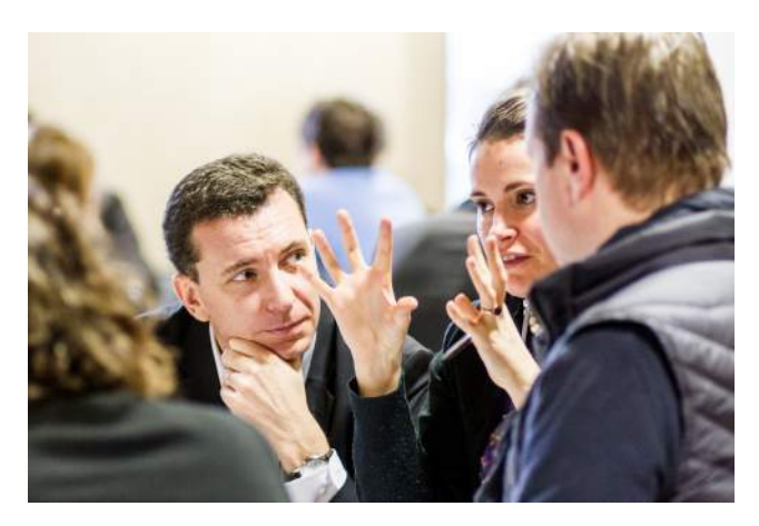
A RICH AND DIVERSE CHOICE OF TOPICS

In its tenth consecutive year, Lift attracted a new record of over 1,250 participants from 37 countries , high-profile speakers, exceptional thinkers and innovation pioneers to explore current and future trends in technology.