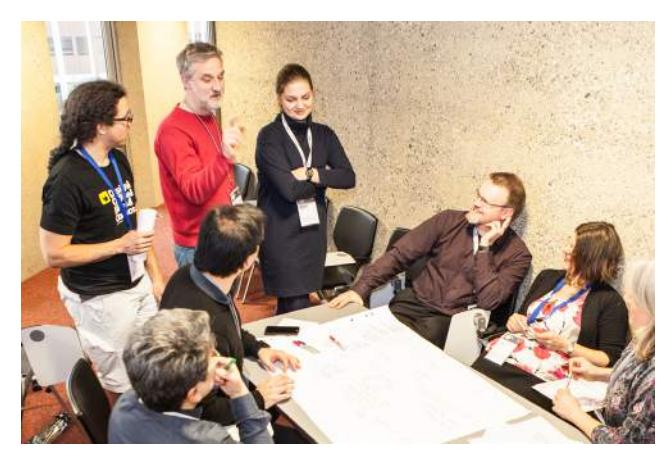
MOST INTERACTIVE FORMAT TO DATE

Once again, events such as the traditional Lift Fondue or the Röstigraben Express contributed to exchanging in a relaxed but productive atmosphere.