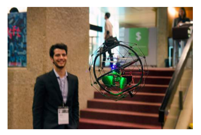
EXPLORING NEW HORIZONS WITH YOU

Finally, during the last quarter of 2015 , we will join swissnex India for our first edition of Lift in Bangalore , thus strengthening our presence in Asia.